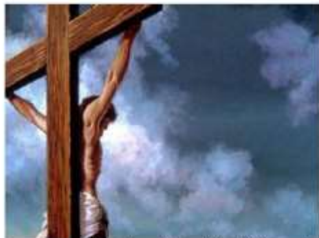
Jesus cut off in the midst of the 70th week.

Daniel 9:26,27 AND AFTER THE SIXTY-TWO WEEKS MESSIAH SHALL BE CUT OFF, but not for Himself; and the people of the prince who is to come shall destroy the city and the sanctuary. The end of it shall be with a flood, and till the end of the war desolations are determined. Then HE SHALL CONFIRM A COVENANT WITH MANY FOR ONE WEEK; but IN THE MIDDLE OF THE WEEK HE SHALL BRING AN END TO SACRIFICE AND OFFERING. And on the wing of abominations shall be one who makes desolate, even until the consummation, which is determined, is poured out on the desolate.