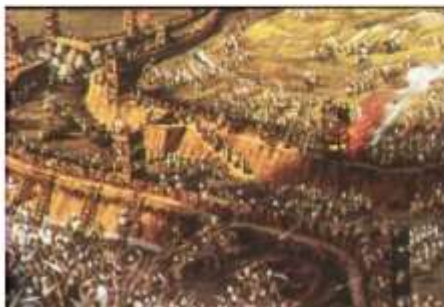
The Destruction of Jerusalem.

The martyrdom of Stephen. A far deeper significance is attached to the stoning of Stephen than may appear to the casual reader. It clinches the former rejection of the Gospel by responsible Jewish leaders at Jerusalem (Acts 7:51-54). It precipitates a new era in Gospel expansion. Exclusive labour for Jews abruptly ceases. Christian witnesses, scattered by the sudden outburst of savage persecution, are impelled to evangelise the Gentiles. Samaritans and the Ethiopian eunuch are the first-fruits from among non-Jews (Acts 8:1,4,5,27,29).