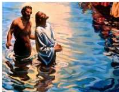
The Baptism of Jesus begins the 70 th week.

The 7 weeks and 62 weeks equal 483 prophetic days or 483 years. This means, counting ahead 483 years from 457 B.C. we are brought to the time of the Messiah, i.e. Jesus Christ. The date comes to 27 A.D.