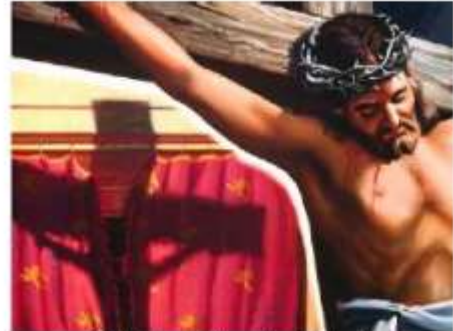
Veil torn when Jesus died.

And they cast him out of the city and stoned him . And the witnesses laid down their clothes at the feet of a young man named Saul. AND THEY STONED STEPHEN as he was calling on God and saying, "Lord Jesus, receive my spirit." Then he knelt down and cried out with a loud voice, "Lord, do not charge them with this sin." And when he had said this, he fell asleep. Now Saul was consenting to his death. At that time a great persecution arose against the church which was at Jerusalem; and they were all scattered throughout the regions of Judea and Samaria, except the apostles.