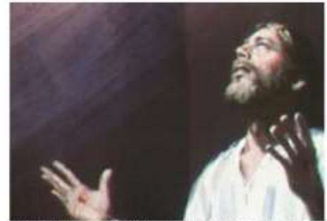
Daniel struggles to fully comprehend the vision but is unable. Before Gabriel finishes the explanation – Daniel faints and the explanation must be continued later in Daniel 9.

Gabriel was unable to continue explanations concerning the vision, because Daniel took sick. All the previous prophecies in the book of Daniel had been explained. The only one left unexplained was the 2,300-day prophecy.