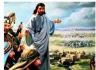
Jesus said in Matt 24:15 that understanding Daniel would be important for the future.

In Daniel Chapter 8 is an interesting prophecy outlining the rise and fall of earthly powers. These are described in more detail in Chapters 2 and 7. In this chapter emphasis is given to the 'little horn' power, which "waxed exceeding great", and brought persecution to God's people. This is explained more fully in another study.