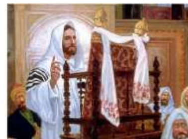
Jesus taught and believed in creation.

Matthew 19:4-6 4 And he answered and said unto them, Have ye not read, that he which made them at the beginning made them male and female, 5 And said, For this cause shall a man leave father and mother, and shall cleave to his wife: and they twain shall be one flesh? 6 Wherefore they are no more twain, but one flesh. What therefore God hath joined together, let not man put asunder.