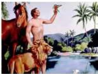
God created the family groups for every creature – you can’t cross-breed across groups (eg cross a bird with a dog).

21 And God created great whales, and every living creature that moveth, which the waters brought forth abundantly, after their kind , and every winged fowl after his kind : and God saw that it was good. .... 24 And God said, Let the earth bring forth the living creature after his kind , cattle, and creeping thing, and beast of the earth after his kind : and it was so. 25 And God made the beast of the earth after his kind , and cattle after their kind , and every thing that creepeth upon the earth after his kind : and God saw that it was good.