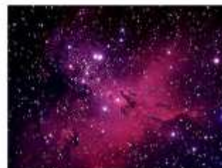
The heavens declare God's glory.

Psalm 33:6,9 6 By the word of the LORD were the heavens made; and all the host of them by the breath of his mouth. .... 9 For he spake, and it was done ; he commanded, and it stood fast.