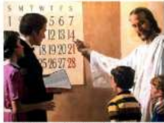
The Sabbath reminds us the world was made in six days.

1 Thus the heavens and the earth were finished, and all the host of them. 2 And on the seventh day God ended his work which he had made; and he rested on the seventh day from all his work which he had made. 3 And God blessed the seventh day, and sanctified it: because that in it he had rested from all his work which God created and made.