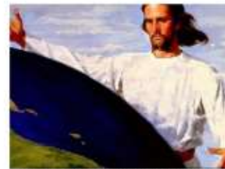
God is all powerful and the source of all life.

God is still able to create. He created life in the beginning and today He can make us anew if we come to Him. He will give us a clean heart. When we come to the cross of Jesus Christ we will be "born again".