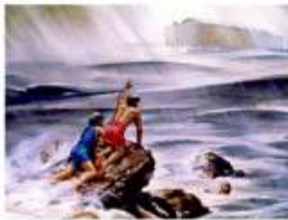
The flood caused the creation of many fossils by burying objects quickly under layers of sediment.

The Bible records show that man has been on this earth for about 6,000 years. This is a far cry from the multi millions of years taught by modern man. The evidence used to determine the age of the earth is found in buried fossils. The remains of different creatures are found in the various rock strata of the earth's surface. The simpler forms of life are usually found in the lower strata, and