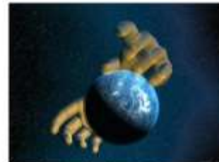
In the beginning God created the heavens and the earth.

Where does the evolutionist begin? Having discarded the Bible record, it is not easy for him, for he must rely on presumption and speculation. The evolutionists theory, (it is only a theory, for evolution cannot be proved) speculates that life began in the remote ages of the past when matter and force existed together, and by chance, life began. It is worth questioning where the force and matter came from. Who made the matter? Who released the force in the universe? Without God, the finite mind finds no satisfactory explanation of life and nature.