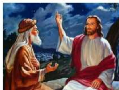
Jesus explaining to Nicodemus about the Holy Spirit.

It is the spirit of Jesus that all of us need to live. As this pure river flows out of the Father, it contains life, blessing and love. What it does not have are those vital ingredients of trusting obedience and submission. It also does not have that sense of