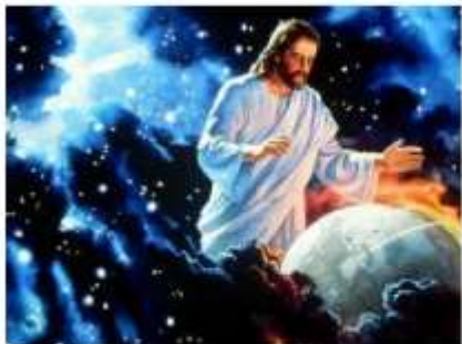
Christ has created all things.

John 1:1-4 In the beginning was the Word, and the Word was with God, and the Word was God. (2) The same was in the beginning with God. (3) All things were made by him; and without him was not any thing made that was made. (4) In him was life; and the life was the light of men.