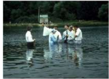
The gospel preached in all the world.

On November 13, 1833 the greatest meteoric shower ever seen occurred. More than 200,000 "shooting stars" fell each hour for six hours. Many had read that the stars would fall, and they were convinced the end of the world had come, and prayed in the streets. These events did not mark the end of time, but were signs that the world had entered into the period of time known as the "time of the end". These happenings marked the "beginning of the end".