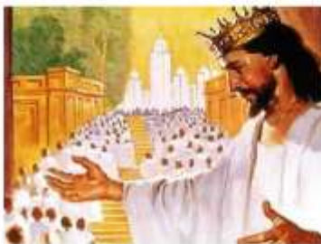
Jesus welcomes saints into heaven.

2 Peter 3:9 The Lord is not slack concerning His promise, as some count slackness, but is longsuffering toward us, not willing that any should perish but that all should come to repentance.