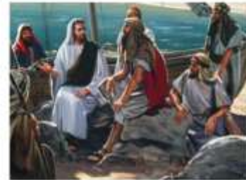
Jesus teaching about Hell.

Jeremiah 17:27 But if you will not heed Me to hallow the Sabbath day, such as not carrying a burden when entering the gates of Jerusalem on the Sabbath day, then I will kindle a fire in its gates, and it shall devour the palaces of Jerusalem, and it shall not be quenched.