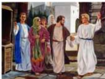
Lot and family escorted out of Sodom.

Sodom and Gomorrah were destroyed by fire many thousands of years ago, yet this text calls the fires of destruction 'eternal fire'. Are these fires burning today? Of course not. Everlasting fire simply means that the fire is eternal in its effects. The everlasting fire at the end of time will destroy the wicked for all time, just as Sodom and Gomorrah were annihilated with never a hope of recovery.