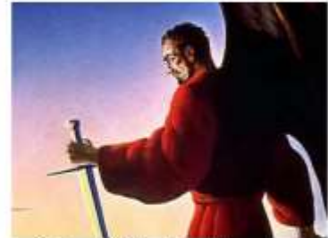
Satan will be burnt to ashes.

Ezekiel 28:18,19 Thou hast defiled thy sanctuaries by the multitude of thine iniquities, by the iniquity of thy traffick; therefore will I bring forth A FIRE FROM THE MIDST OF THEE, it shall devour thee, and I WILL BRING THEE TO ASHES upon the earth in the sight of all them that behold thee. All they that know thee among the people shall be astonished at thee; thou shalt be a terror and NEVER SHALT THOU BE ANYMORE. (KJV)