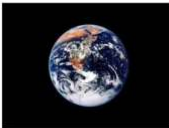
Hell will be on the earth.

Matthew 13:40-42 Therefore as the tares are gathered and burned in the fire, so it will be at the end of this age. The Son of Man will send out His angels, and they will gather out of His kingdom all things that offend, and those who practice lawlessness, and will cast them into the furnace of fire. There will be wailing and gnashing of teeth.