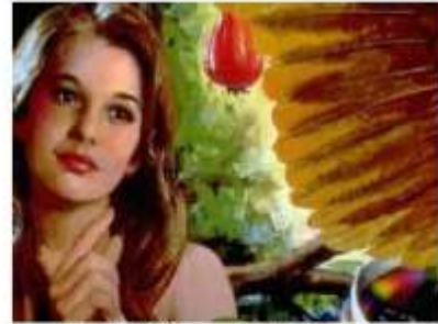
Adam & Eve were tempted to believe that they were immortal.

The devil would have Adam and Eve believe they were immortal (not subject to death) but here it is clearly taught that our bodies are mortal (subject to death). Many today believe man is naturally immortal, even if he has been the worst of sinners, and that some part of him will never die. Millions have been deceived by the devil's assurance: "You will not surely die".