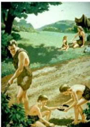
In the sweat of thy face shalt thou eat bread till thou return unto the ground.

Ecclesiastes 12:7 Then the DUST WILL RETURN TO THE EARTH as it was, And the SPIRIT WILL RETURN TO GOD who gave it.