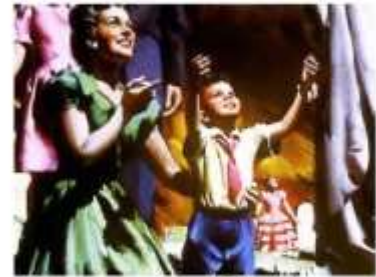
The resurrection of the righteous.

1 Corinthians 15:19,20 If in this life only we have hope in Christ, we are of all men the most pitiable. But now CHRIST IS RISEN FROM THE DEAD, and has BECOME THE FIRSTFRUITS OF THOSE WHO HAVE FALLEN ASLEEP.