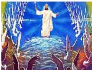
At the Second Coming of Jesus – Death will be conquered.

Some are concerned for those who have died in some terrible way, and the body has been mangled or eaten by wild animals, or some other tragic thing has happened. There is no need to be concerned. God promises in 1 Corinthians 15 to give us a new incorruptible body. We will not possess the same atoms of flesh we now have. In the meantime, God preserves our individual personality and character, then just as He created Adam, so He will re-create us – perfect – to live forever.