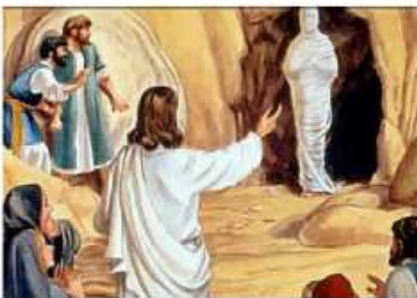
Jesus raises Lazarus from the sleep of death.

John 11:11-14 These things He said, and after that He said to them, “OUR FRIEND LAZARUS SLEEPS, but I go that I may wake him up.” Then His disciples said, “Lord, if he sleeps he will get well.” However, Jesus spoke of his death, but they thought that He was speaking about taking rest in sleep. THEN JESUS SAID TO THEM PLAINLY, “LAZARUS IS DEAD”.