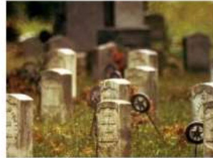
The dead know not anything.

Ecclesiastes 9:5,6 For the living know that they will die; But the DEAD KNOW NOTHING, and they have no more reward, for the memory of them is forgotten. Also THEIR LOVE, THEIR HATRED, AND THEIR ENVY HAVE NOW PERISHED; nevermore will they have a share in anything done under the sun.