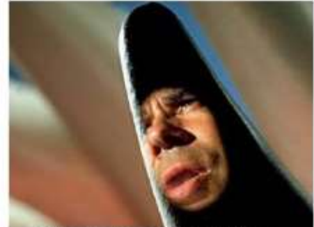
The little horns of Daniel Seven

This chapter seven of Daniel is discussed fully in Study 28 . Notice the power mentioned here is said to “think to change times and laws”. Here is predicted a change in the law of God, and as we look back in history we can see the fulfilment of this prophecy. Changes were made in the law of God, and in particular, the commandment referring to time; “Remember the Sabbath day”. The church openly admits having brought about a change in transferring the solemnity of the Sabbath to Sunday. There is no record anywhere of God's authorisation; rather, man changed it. The change did not occur suddenly, but was a gradual process until the seventh day was almost entirely lost sight of.