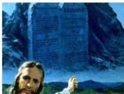
Who will you follow – Jesus and His word or man and his tradition?

We have the choice of obeying God or man, the commandments of God or the commandments of a church. We can choose to keep the first day, Sunday, the counterfeit, or the seventh day, the Sabbath, the genuine. Our choice of a day of worship indicates who we choose as Master.