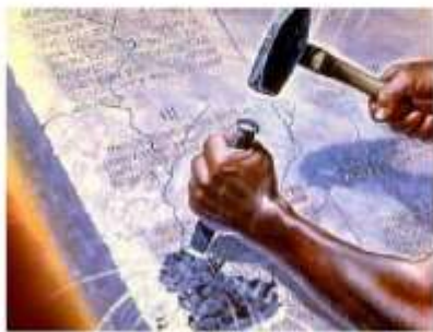
The Sabbath of God was slowly replaced with the Sunday of man.

Christians faithfully observed the Sabbath after Christ died. But within the first few centuries there was rapid deterioration of the faith. The seemingly harmless roots of later changes go back to the time of the apostles, just as Paul predicted. While Philip and John were still living, Christians voluntarily commenced celebrating the crucifixion weekend. They centred their celebrations on the crucifixion day, which was the day of the Jewish Passover. Christians suffered much from their origin as a Jewish sect, and the commemoration of the Passover day in memory of the crucifixion was seen in Rome as further identifying Christianity with Judaism. They decided to make a change.