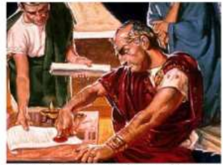
Constantine's Famous Sunday Law of A.D. 321.

The next important act in the drama came in A.D. 200 when Pope Victor sought to enforce the annual observance of resurrection Sunday. He ordered all bishops excommunicated who would not follow the plan of celebrating the resurrection festival. Sunday observance was the vehicle the Bishop of Rome used in his attempt to gain control of the church. Rome’s influence, however, was still very limited, for in A.D. 450 Socrates, the skilled church historian, could write: