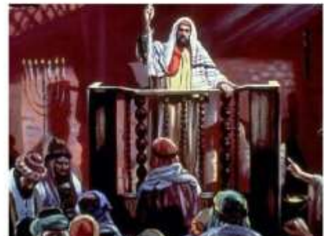
Paul reasoning in the Synagogue.

In contrast to sun worship, the apostle Paul was found worshipping on the Sabbath. This was twenty-three years after the resurrection of Christ. It is quite evident that the first day of the week had not taken the place of the seventh day at this stage. Because such a change cannot be found in the