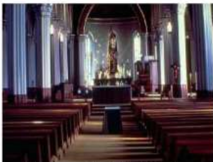
The Roman Church Capitalised on Constantine’s Law and pressed it further.

“The church ... took the pagan Sunday and made it the Christian Sunday ... and thus the pagan Sunday, dedicated to Balder, became the Christian Sunday sacred to Jesus.” The Catholic World , Vol.58, No.338, page 809.