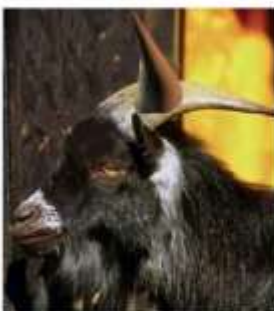
A little horn arose out of one of the four horns.

Some have mistaken the little horn to be Antiochus Epiphanes, king of Syria who was a great enemy and persecutor of the Jews. But as we will see, it cannot be so, because he does not fit into the details of the prophecy.