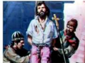
As in the Dark Ages, this persecuting power will persecute God's people again.

Daniel 8:23-25 And in the latter time of their kingdom, when the transgressors have reached their fullness, A KING SHALL ARISE, HAVING FIERCE FEATURES, WHO UNDERSTANDS SINISTER SCHEMES. HIS POWER SHALL BE MIGHTY , but not by his own power; he shall destroy fearfully, and shall prosper and thrive; HE SHALL DESTROY THE MIGHTY, AND ALSO THE HOLY PEOPLE . Through his cunning he shall cause deceit to prosper under his rule; and he shall exalt himself in his heart. He shall destroy many in their prosperity. HE SHALL EVEN RISE AGAINST THE PRINCE OF PRINCES ; but he shall be broken without human means.