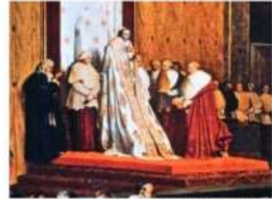
The Papacy is the Little Horn of Daniel Eight.

For a full identification of the “little horn” see the study on Daniel 7 . We do notice however, that the little horn “grew up to the host of heaven.” And this was certainly true of Rome. It grew out of pagan Rome and became great not by conquest but by religious dominance combined with the power of the state.