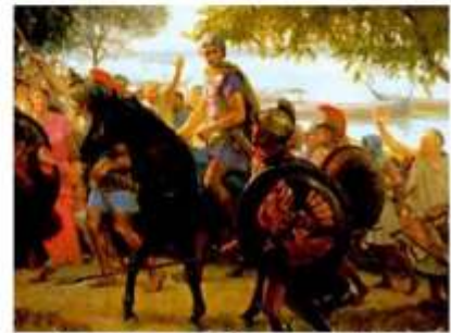
Large horn on Goat symbolized Alexander the Great.

Here is emphasized the sudden fall of Alexander. He was the large horn that was broken. This mighty warrior died at the age of thirty-three, partly because of his overexertions in conquering the world, and partly from a fever caused by his intemperate living. After a drunken debauch he was seized with a violent fever and died eleven days later, June 13, 323 B.C. Before he died he was asked who should rule the kingdom. His reply was "let it go to the strongest!" Alexander's brother and two infant sons were declared rulers of the empire, but they were soon murdered and the family of Alexander became extinct. Thus there were twenty years of strife between the generals of Alexander as they struggled for the supremacy. Ultimately the empire was divided into four kingdoms, paralleling the four notable horns. Macedonia was ruled by Cassander, Thrace and Asia Minor by Lysimachus, Syria by Seleucus and Egypt by Ptolemy.