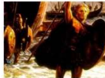
The Goat symbolized the conquest of Greece.

The he goat in the vision symbolizes the kingdom of Greece as explained in verse 21 – "The male goat is the kingdom of Greece. The large horn... is the first king." The king of Greece was the well-known historical figure – Alexander the Great. Alexander claimed to be the offspring of Jupiter Ammon, whose symbol was a goat. His strength and speed of conquest are aptly described in his notable overthrow of the ram. Alexander first vanquished the