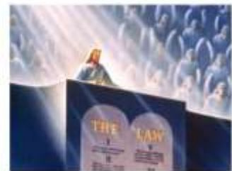
Little Horn Power exposed and condemned in the heavenly Judgment that began in 1844.

For more detail on the 2300 days, see the study on the 2300-day prophecy and the judgment . It is no wonder the heavenly watchers were alarmed and anxiously asked, “How long will the vision be?” No wonder it seemed to be too much for Daniel and he “fainted and was sick for days.” The dominance of this antichrist power and the persecution of God’s people were almost too much to bear. The meaning of this prophecy was not understood in this chapter. The final verse says clearly that none understood the vision. Daniel understood all features of the vision explained to him, except the 2300 days. Daniel 9 reveals the meaning of the first 70 weeks of the 2300 days. Daniel 8:14 tells us what happens at the close of the 2300 days – the sanctuary would be “cleansed” or “justified” (margin) indicating judgment. This was the beginning of a worldwide movement proclaiming God’s judgment hour message, and the beginning of the investigative judgment in heaven.