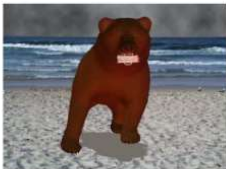
The bear represents Medo Persia.

Daniel 7:5 And suddenly another beast, A SECOND, LIKE A BEAR. It was raised up on one side, and had three ribs in its mouth between its teeth. And they said thus to it: "Arise, devour much flesh!"