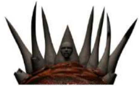
A little horn comes up.

“Arises after the ten horns”. The ten kingdoms were finally established in A.D. 476. The Papacy received her political supremacy and came into prominence at a later date. (Approximately A.D. 538.)