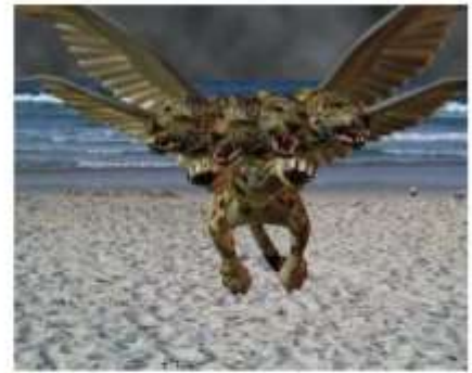
The leopard representing Greece.

The dreadful beast very fittingly represented the fourth successive world empire and that was Pagan Rome. The iron teeth parallel with the iron legs of the image in Daniel 2:40. The ten horns of this fourth beast pictured the break up of power of Pagan Rome into the divisions of Western Europe, which were finally established by the year A.D. 476. This corresponds with the feet and toes of Daniel 2:41-43.