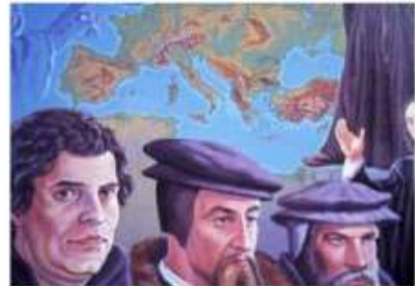
Reformers like Luther, Tyndale & Calvin identified the Papacy as the Antichrist.

Up till the Revolution, France had been a leading supporter of the Papacy for many centuries, and was called "The Eldest Son of the Church". Consequently this disaster brought to an end the age-long political supremacy of the bishop of Rome, and dealt the Papacy a wound from which it has not yet fully recovered.