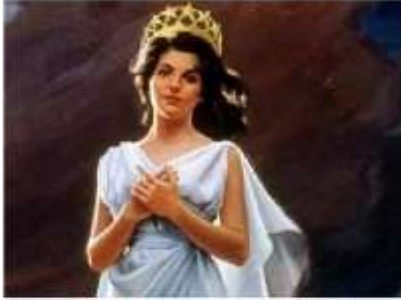
Christ's Bride – the church will always cling to the commandments of God and the faith of Jesus.

“Authoritative Quotations on the Sabbath and Sunday”, “From Sabbath to Sunday”.)