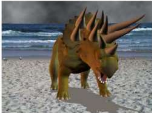
The fourth beast represents Rome.

I was considering the horns, and THERE WAS ANOTHER HORN, A LITTLE ONE, COMING UP AMONG THEM, before whom THREE OF THE FIRST HORNS WERE PLUCKED OUT BY THE ROOTS. And there, in this horn, were eyes like the eyes of a man, and A MOUTH SPEAKING POMPOUS WORDS. Then I wished to know the truth about the fourth beast, which was different from all the others, exceedingly dreadful, with its teeth of iron and its nails of bronze, which devoured, broke in pieces, and trampled the residue with its feet; and the ten horns that were on its head, and the other horn which came up, before which three fell, namely, that horn which had eyes and a mouth which spoke pompous words, whose APPEARANCE WAS GREATER THAN HIS FELLOWS.