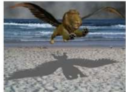
The lion represents Babylon.

Daniel 7:4 The first was like a LION, AND HAD EAGLE'S WINGS. I watched till its wings were plucked off; and it was lifted up from the earth and made to stand on two feet like a man, and a man's heart was given to it.