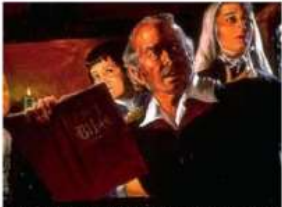
The Bible was forbidden to be read by laymen during the dark ages.

“SPEAK POMPOUS WORDS AGAINST THE MOST HIGH.” The Papacy has done this. e.g. The Catholic National , July 1895. “The Pope is not only the representative of Jesus Christ, but He is Jesus Christ Himself, hidden under the veil of flesh.”