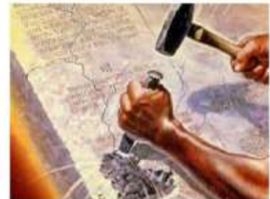
Satan hates God's law.

Here it is plainly shown that seas or waters represent peoples and nations.