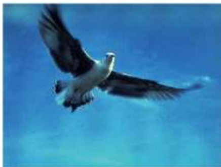
We need the guidance of the Holy Spirit to understand the Bible.

Matthew 7:21 21 Not every one that saith unto me, Lord, Lord, shall enter into the kingdom of heaven; but he that doeth the will of my Father which is in heaven.