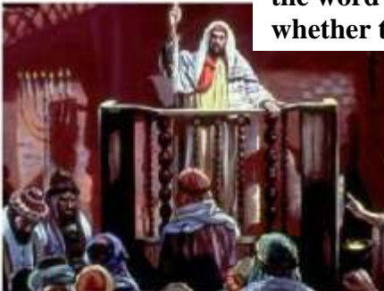
Paul commended the Bereans for searching the Bible every day.

11 These were more noble than those in Thessalonica, in that they received the word with all readiness of mind, and searched the scriptures daily, whether those things were so.