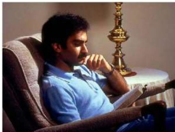
Daily Bible study is important for spiritual development.

God has done so much for us in giving us the Bible, but He also gave us His Son to die on Calvary. Today He is asking for your life, that He might save it for eternity. Friend, read His Word and you will know how to live a life of victory through Christ.