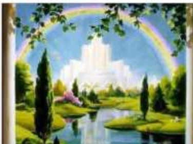
The Third Heaven – where God dwells.

Hebrew 11:10,16 For he WAITED FOR THE CITY which has foundations, WHOSE BUILDER AND MAKER IS GOD. But now THEY DESIRE A BETTER, THAT IS, A HEAVENLY COUNTRY. Therefore God is not ashamed to be called their God, for He has PREPARED A CITY FOR THEM.