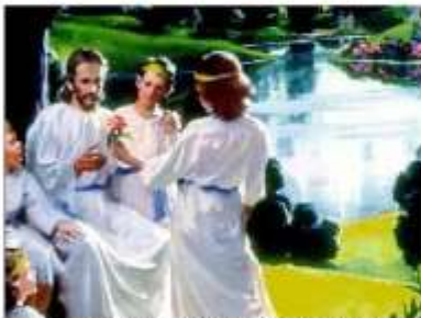
What a wonderful place it will be.

Revelation 22:14,15 Blessed are THOSE WHO DO HIS COMMANDMENTS, that they may HAVE THE RIGHT TO THE TREE OF LIFE, and may enter through the gates into the city. But outside are dogs and sorcerers and sexually immoral and murderers and idolaters, and whoever loves and practices a lie.