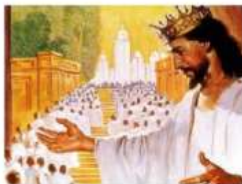
We shall see His face.

They SHALL SEE HIS FACE, and His name shall be on their foreheads.