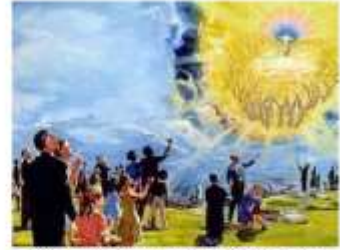
The righteous raised from the dead at the Second Coming.

1 Corinthians 13:12 For NOW WE SEE IN A MIRROR, DIMLY, but then face to face. Now I know in part, but then I shall know just as I also am known.