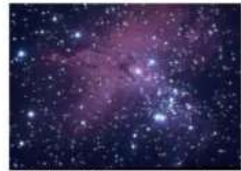
The Second Heaven – the realm of the sun, moon, stars.

To picture the glories of this eternal land is beyond our comprehension. Our wildest imaginations cannot conceive what heaven is really like. We only know God's promises are sure, and if He has promised these things, and by faith we accept them, then, if we remain faithful, we will one day receive them.