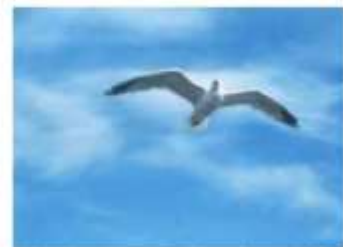
The First Heaven – the realm of birds and clouds.

2 Corinthians 12:4 How he was CAUGHT UP INTO PARADISE and heard inexpressible words, which it is not lawful for a man to utter.