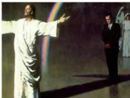
Christ will cover us in the Judgment.

Revelation 3:5 He who overcomes shall be clothed in white garments, and I will not blot out his name from the Book of Life; but I WILL CONFESS HIS NAME BEFORE My FATHER and before His angels.