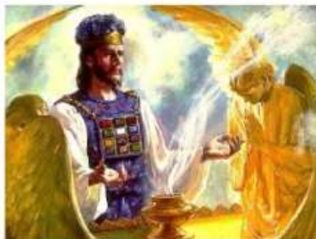
Christ is now in heaven interceding for us while the Judgment takes place.

The judgment began in 1844 is an “investigative judgment”, similar to judgment in court. The “executive judgment”, when sinners are destroyed takes place at the end of the world. This can be paralleled to a man facing the death sentence for his crime. He has been tried, (investigation), found guilty, (declaration or sentence) and put to death (execution or punishment).