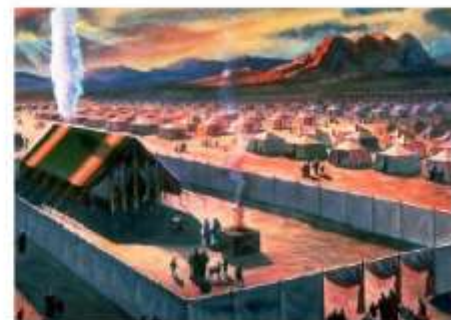
The whole plan of salvation including the judgment was given to Israel in the sanctuary system.

The Sanctuary was built as a central place for sacrifice. God desired to dwell among His people, so the sanctuary was set up, in order that the people could be cleansed of their sins through the shedding of blood, thus enabling God to dwell with them.