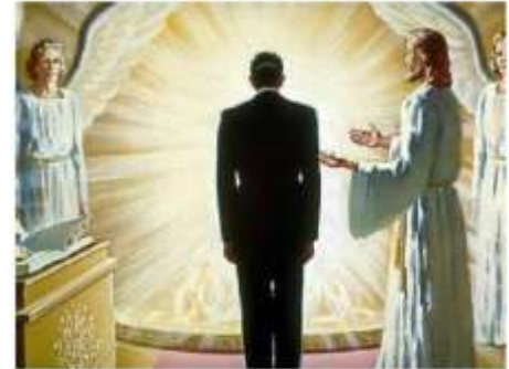
If we have accepted Christ as our Saviour, we are assured of victory in the Judgment.

Hebrews 7:25 Therefore He is also able to save to the uttermost those who come to God through Him, since HE ALWAYS LIVES TO MAKE INTERCESSION FOR THEM.