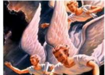
The Three Angels of Revelation 14.

Revelation 14:6,7 Then I saw another angel flying in the midst of heaven, having the EVERLASTING GOSPEL to preach to those who dwell on the earth—to every nation, tribe, tongue, and people—saying with a loud voice, “Fear God and give glory to Him, for THE HOUR OF HIS JUDGMENT HAS COME; and worship Him who made heaven and earth, the sea and springs of water.”