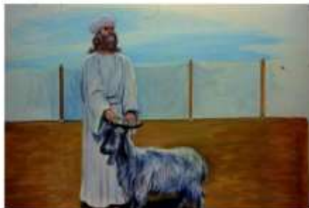
Priest transferring sins to the Azazel goat in the Day of Atonement ritual.

Leviticus 16:7-10 He shall take the TWO GOATS and present them before the LORD at the door of the tabernacle of meeting. Then Aaron shall cast lots for the two goats: one lot for the LORD and the other lot for the scapegoat. And Aaron shall bring the goat on which the LORD’s lot fell, and OFFER IT AS A SIN OFFERING. But the goat on which the lot fell to be the scapegoat shall be presented alive before the LORD, to make atonement upon it, and to let it go as the SCAPEGOAT INTO THE WILDERNESS.