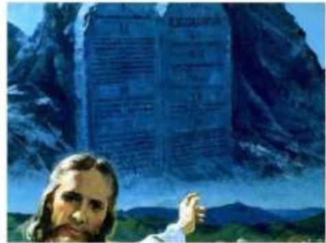
The standard of Judgment – God's Law.

In summary, the earthly sanctuary was a pattern of the heavenly sanctuary. The first apartment entered daily by the priests on earth parallels the first apartment in heaven, where Christ entered after His ascension. The Most Holy Place on earth was entered on the day of judgment, and in heaven Christ entered the Most Holy Place at the commencement of the investigative judgment in fulfilment of the 2,300 day prophecy. The two goats on earth represented: