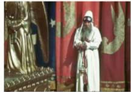
Priest entering the Most Holy Place on the Day of Atonement.

Leviticus 16:29,30 This shall be a statute forever for you: In the seventh month, on the tenth day of the month, YOU SHALL AFFLICT YOUR SOULS, and do no work at all, whether a native of your own country or a stranger who dwells among you. For on that day THE PRIEST SHALL MAKE ATONEMENT FOR YOU, to cleanse you, that you may be clean from all your sins before the LORD.