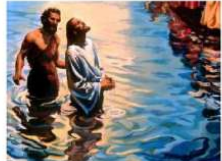
The Baptism of Jesus begins the 70 th week.

The 7 weeks and 62 weeks equal 483 prophetic days or 483 years. This means, counting ahead 483 years from 457 B.C. we are brought to the time of the Messiah, i.e. Jesus Christ. The date comes to 27 A.D.