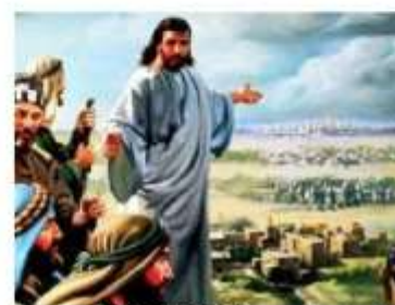
Jesus said in Matt 24:15 that understanding Daniel would be important for the future.

In Daniel Chapter 8 is an interesting prophecy outlining the rise and fall of earthly powers. These are described in more detail in Chapters 2 and 7. In this chapter emphasis is given to the 'little horn' power, which "waxed exceeding great", and brought persecution to God's people. This is explained more fully in another study.