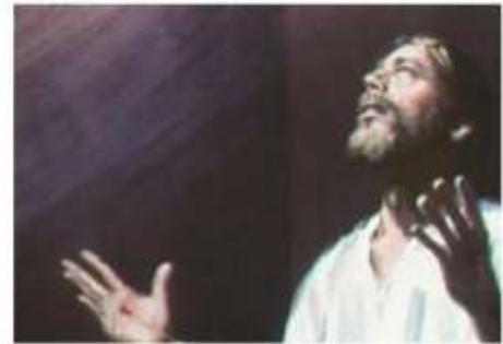
Daniel struggles to fully comprehend the vision but is unable. Before Gabriel finishes the explanation – Daniel faints and the explanation must be continued later in Daniel 9.

Gabriel was unable to continue explanations concerning the vision, because Daniel took sick. All the previous prophecies in the book of Daniel had been explained. The only one left unexplained was the 2,300-day prophecy.