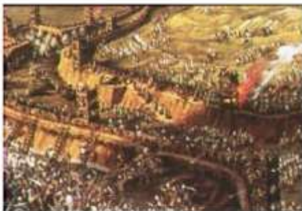
The Destruction of Jerusalem.

The martyrdom of Stephen. A far deeper significance is attached to the stoning of Stephen than may appear to the casual reader. It clinches the former rejection of the Gospel by responsible Jewish leaders at Jerusalem (Acts 7:51-54). It precipitates a new era in Gospel expansion. Exclusive labour for Jews abruptly ceases. Christian witnesses, scattered by the sudden outburst of savage persecution, are impelled to evangelise the Gentiles. Samaritans and the Ethiopian eunuch are the first-fruits from among non-Jews (Acts 8:1,4,5,27,29).