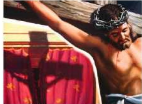
Veil torn when Jesus died.

“Lord Jesus, receive my spirit.” Then he knelt down and cried out with a loud voice, “Lord, do not charge them with this sin.” And when he had said this, he fell asleep. Now Saul was consenting to his death. At that time a great persecution arose against the church which was at Jerusalem; and they were all scattered throughout the regions of Judea and Samaria, except the apostles.