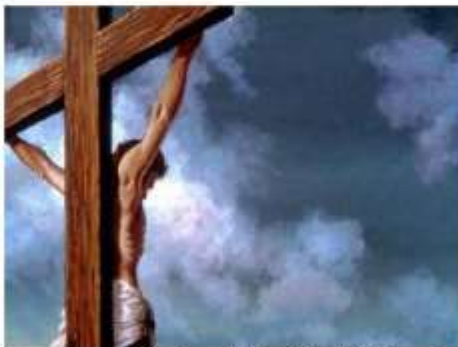
Jesus cut off in the midst of the 70th week.

AND AFTER THE SIXTY-TWO WEEKS MESSIAH SHALL BE CUT OFF, but not for Himself; and the people of the prince who is to come shall destroy the city and the sanctuary. The end of it shall be with a flood, and till the end of the war desolations are determined. Then HE SHALL CONFIRM A COVENANT WITH MANY FOR ONE WEEK; but IN THE MIDDLE OF THE WEEK HE SHALL BRING AN END TO SACRIFICE AND OFFERING. And on the wing of abominations shall be one who makes desolate, even until the consummation, which is determined, is poured out on the desolate.