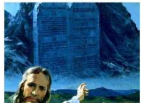
Jesus gives us power to overcome and be obedient to Him.

By this we know that we love the children of God, when we love God and keep His commandments. For THIS IS THE LOVE OF GOD, THAT WE KEEP HIS COMMANDMENTS. And His commandments are not burdensome.