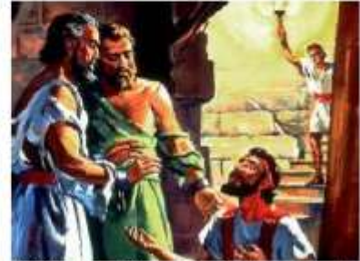
Philippian Jailer asks what must do to be saved

True repentance is a gift of God. It is the goodness of God that leads to repentance and not something sinful man seeks after. But again man is given the choice to repent or not to repent, and in this Jesus is most definite – repent or perish. However, there are two types of repentance, genuine and non-genuine. For example, a little boy may be very repentant for his wrong because he is going to get the strap. He is sorry he is going to be punished, but he is not sorry for the wrong he has done. So a person may be sorry for the results of sin, but not sorry for the sin itself – this type of repentance is not genuine. True repentance is manifest in genuine sorrow for sins committed.