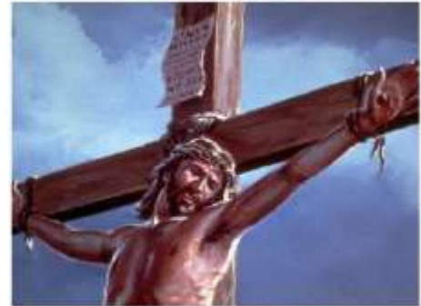
As Christians we die to the old way of life and in this sense are crucified with Christ.

I have been crucified with Christ; it is no longer I who live, but CHRIST LIVES IN ME; and the life which I now live in the flesh I live by faith in the Son of God, who loved me and gave Himself for me.