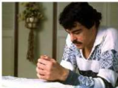
If we confess our sins – Jesus promises to forgive us.

1 John 1:9 IF WE CONFESS OUR SINS, He is faithful and just to FORGIVE US OUR SINS and to CLEANSE US FROM ALL UNRIGHTEOUSNESS.