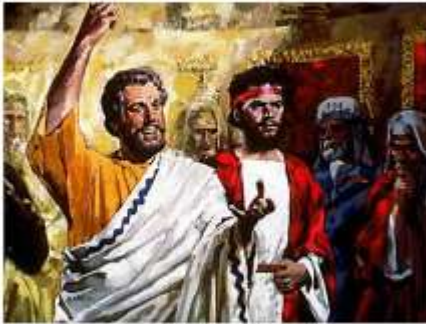
An amazing conversion took place in the life of Peter after the resurrection of Jesus.

Jesus answered and said to him, “Most assuredly, I say to you, UNLESS ONE IS BORN AGAIN, HE CANNOT SEE THE KINGDOM OF GOD.... Most assuredly, I say to you, unless one is born of water and the Spirit, he cannot enter the kingdom of God. That which is born of the flesh is flesh, and that which is born of the Spirit is spirit. Do not marvel that I said to you, ‘YOU MUST BE BORN AGAIN.’”