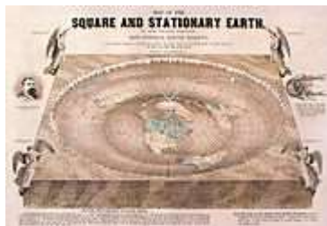
Map of the Square and Stationary Earth by Orlando Ferguson (1893). [17]

Motives for advocating a flat over a round earth despite evidence to the contrary vary. (Even typical young-earth creationists who think it's 6000 years old don't go so far as to say that it's not round. [18] ). Modern geocentrists make a point of distancing themselves from the flat earth belief. Charles K. Johnson based his flat earth belief on a hyper-literal interpretation of the Bible (asserting that Jesus' ascent "up" into Heaven is proof of a flat earth, since a round earth would have no "up" or "down").