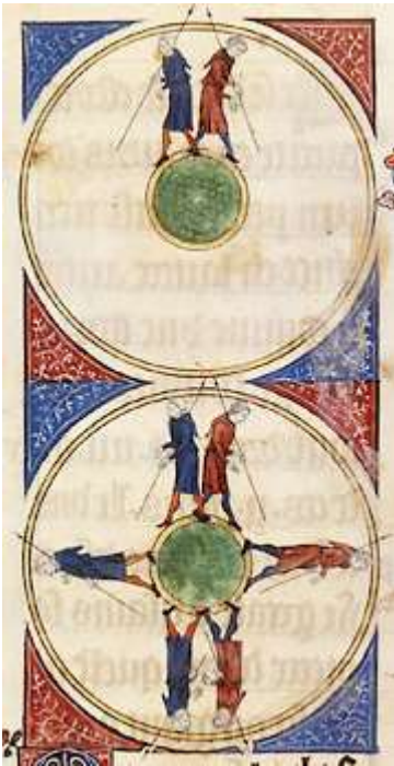
High Mediaeval illustration of a spherical Earth.

On certain length scales, the Earth certainly is flat — the ground on what we like to call flatland certainly doesn't look like it has any significant curvature in everyday life. In a mountainous region, the local geography is so variable that discerning a curve would be even more difficult. As a result of this, a common sense interpretation of a flat Earth can be reached pretty quickly.