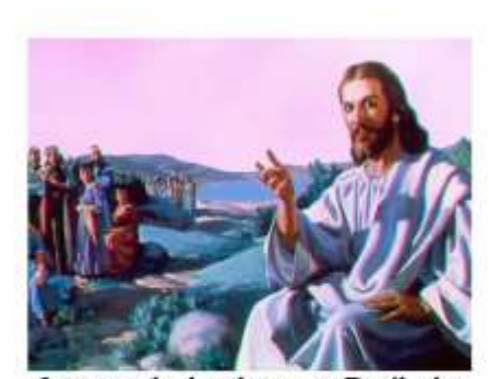
Jesus taught that there was Devil who was the author of sin.

Ezekiel 28:12-15 <sup>12</sup> Son of man, take up a lamentation upon the king of Tyrus, and say unto him, Thus saith the Lord GOD; Thou sealest up the sum, full of wisdom, and perfect in beauty. <sup>13</sup> Thou hast been in Eden the garden of God; every precious stone was thy covering, the sardius(ruby) , topaz, and the diamond, the beryl, the onyx, and the jasper, the sapphire, the emerald, and the carbuncle, and gold: the workmanship of thy tabrets and of thy pipes was prepared in thee in the day that thou wast created. <sup>14</sup> Thou art the anointed cherub that covereth; and I have set thee so : thou wast upon the holy mountain of God; thou hast walked up and down in the midst of the stones of fire. <sup>15</sup> Thou wast perfect in thy ways from the day that thou wast created, till iniquity was found in thee.