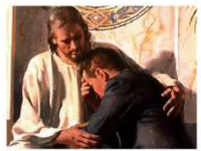
Jesus loves us and will defeat His and our enemy - Satan.

To reverse the procedure would bring defeat. We have nothing to fear while we constantly surrender our lives to Jesus Christ. We need never fear the devil – in fact it is better to think of Jesus.