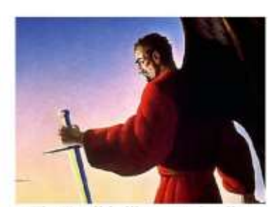
The Devil is like a roaring lion seeking to devour us.

GOD WILL YET DO SOMETHING ABOUT SUFFERING. Those who accept the gospel are given the reward of living in God's eternal kingdom where sin and suffering will never arise. Soon Satan, sin, sinners and suffering will be gone. The wickedness of sin will have filled its cup of iniquity and will prove beyond doubt to the whole universe that sin and its government must be shunned for eternity. Even Satan will be destroyed. His outcome is eternal death; meaning he will be as though he never existed. The lake of fire will bring about his destruction. The torment he experiences will largely be the pain of rejecting the most loving being in the universe – God.