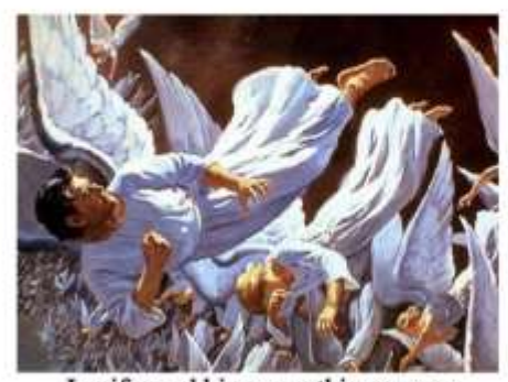
Lucifer and his sympathisers were removed from heaven.

Lucifer was cast out of heaven because of a long succession of selfish choices. He came to live in one narrow dimension: "I". This is how Lucifer, the Archangel, perfect and sinless, debased himself into Satan, the devil. So selfish had he become that he aspired to take God's position of rulership. He wanted God's power, but not His character of love.