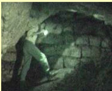
Tunnel entrance, through which the Ark was taken, is now walled up