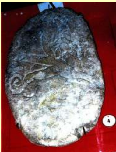
Carving found near tunnel entrance dating to the time of the invasion