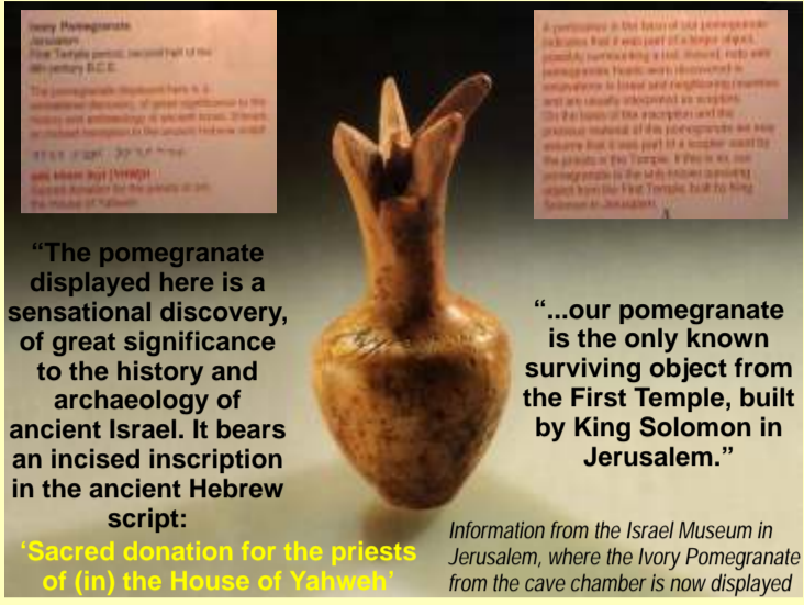
Ivory Pomegranate - recovered from the chamber and on public display