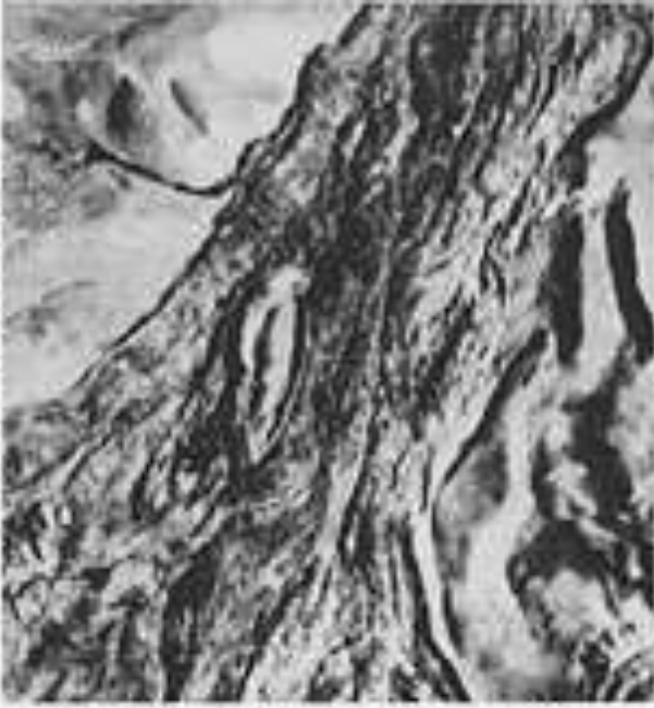
FROM THE AIR the elongated outline lies in the crevice of a hillside on the slope of a mountain that is only 20 miles from the Russian border. The tradition is of recent origin, was first picked up by local residents around the strange form. The photo was shot by a Turkish aerial survey plane from 10,000 feet.