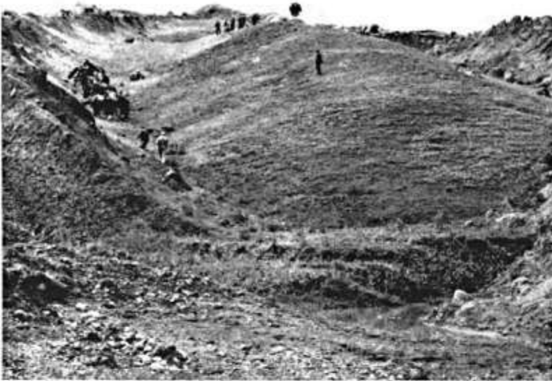
FROM THE GROUND , at the "stern," the 160-foot-wide object is seen to have grass-covered mound in center. The 20-foot-high rim dwarfs expedition's horses.