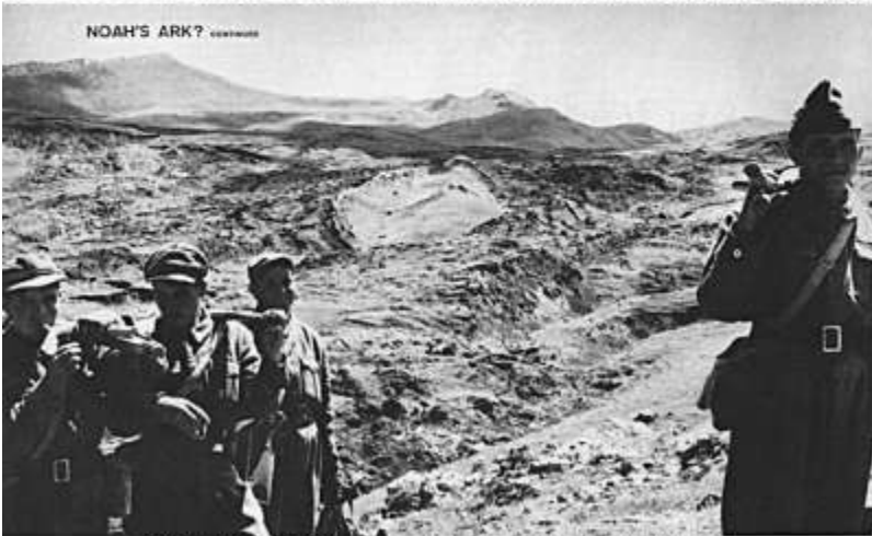
ON THE RUGGED PLATEAU the smooth oval form in rear center contrasts with gullied terrain around it. "Prow" points toward peaks of Agri-Tensürük area. Turkish soldiers, who escorted expedition, dynamited section of object's thick packed-earth side. Small bits of wood but no large chunks were found in rim.

Many in the group felt the same way. A second trench was decided upon but nothing was found. Also, the 15 foot high side revealed nothing so they decided to retire for the evening. The next day they tried a different technique. One in the group asked Major Baykal if he had any dynamite. He said no but they had plenty of black powder. So it was decided to blow a hole in the side of the object. The team's archaeologist strongly objected to this unorthodox technique but the rest felt there was no alternative. They were running out of time.